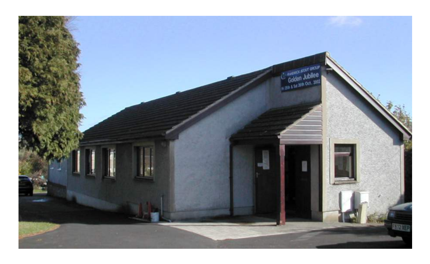
\label{eq:Page 1 of 72} Page \ 1 \ of \ 72 \\ G:\Shared \ drives\Exec\History\Haggis\History \ of \ Randwick \ Scout \ Group - \ 2021 \ Updated - \\ Compressed.docx