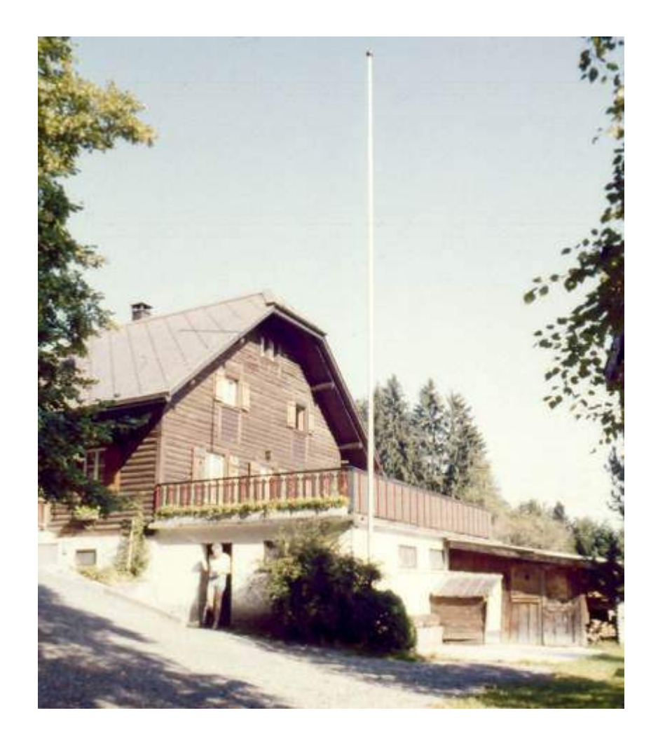
The Scout Chalet on the lower slopes of Mt. Pilatus above Kriens where the first part of the Group Expedition to Switzerland was spent.