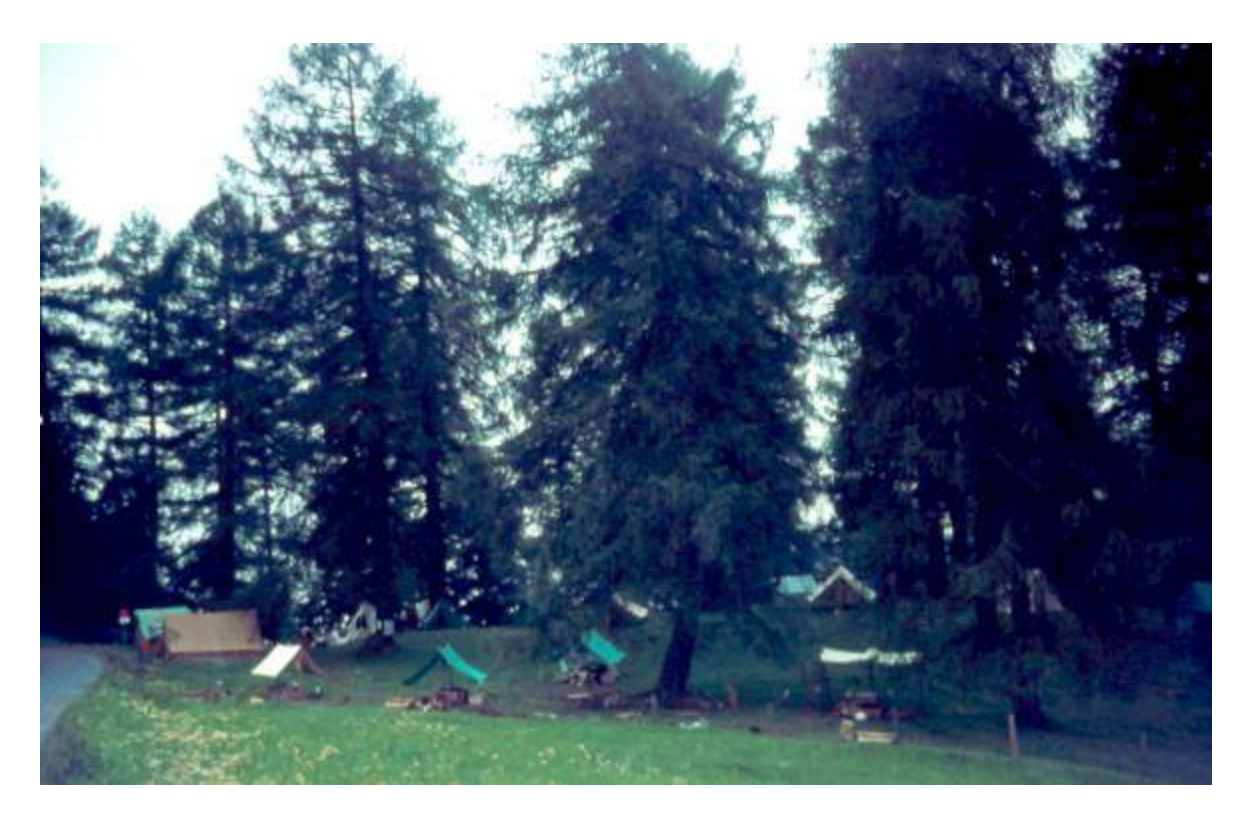
The campsite at Eigenthal