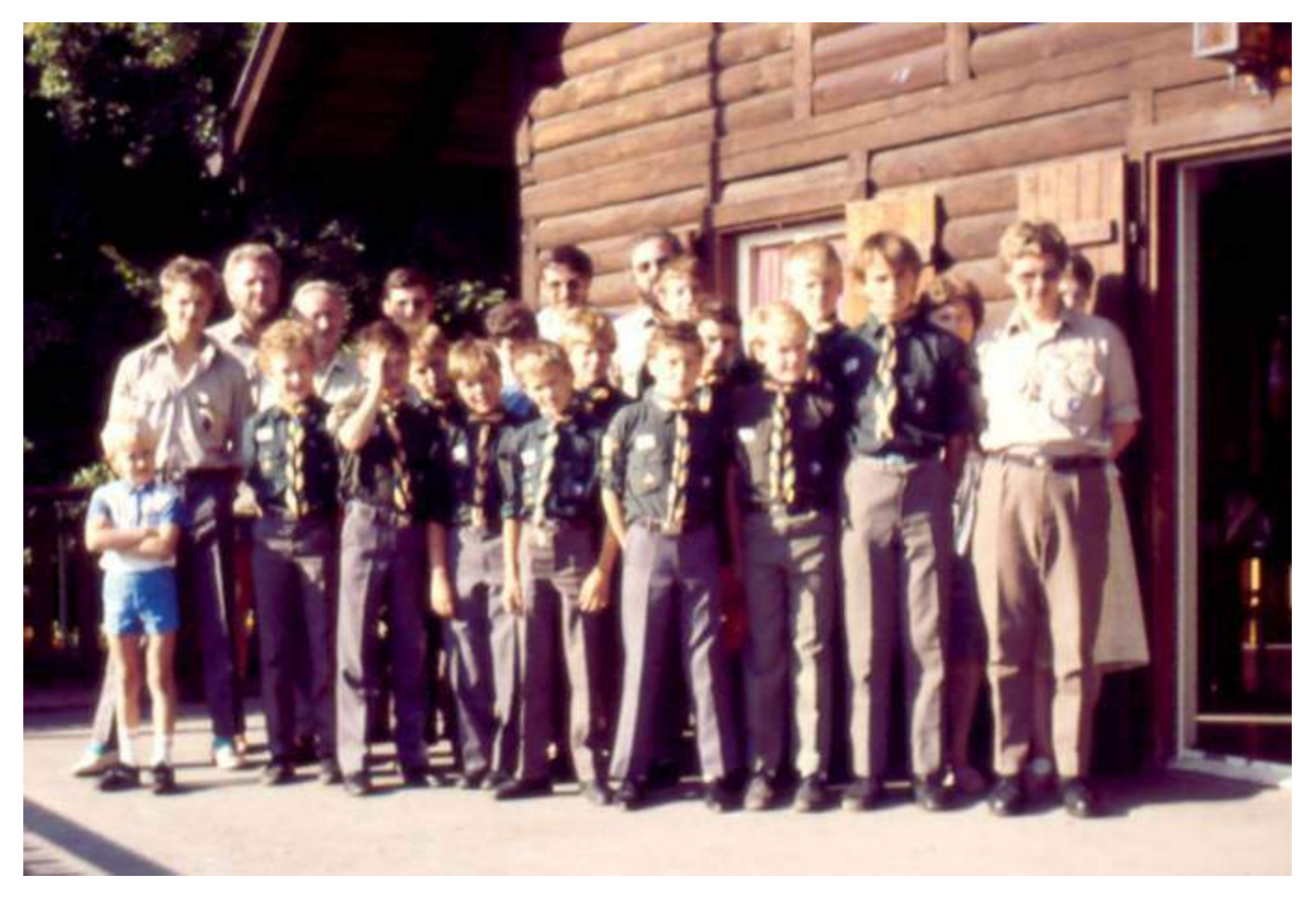
Outside the Scout Chalet at Kriens