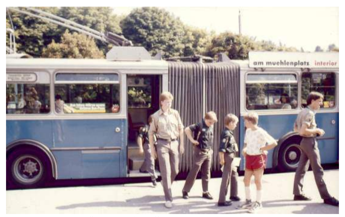
Scouts getting off a trolley Bus in Luzern