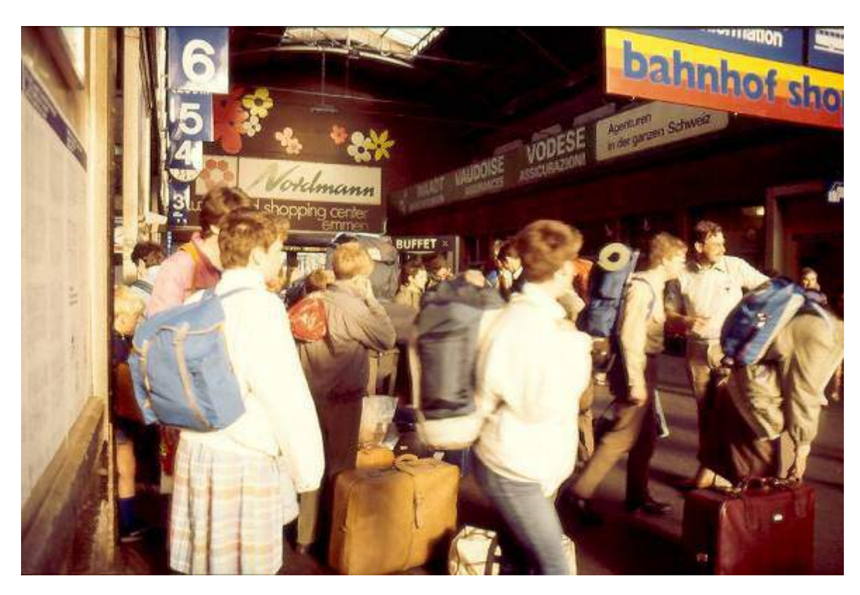
Randwick Scouts Arriving at Luzern Railway Station having travelled by Coach to London and then on to Luzern by Train.