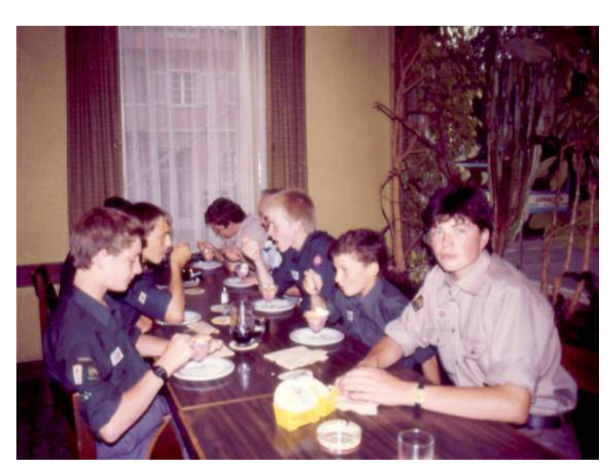
Scouts at the Expedition Meal held in the Restaurant Militargarten, Allmend, Luzern.