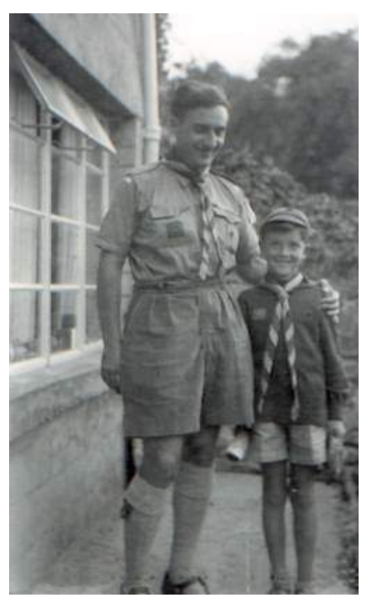
The First Leader

22<sup>nd</sup> October Randwick Scout Group Registered with Scout HQ