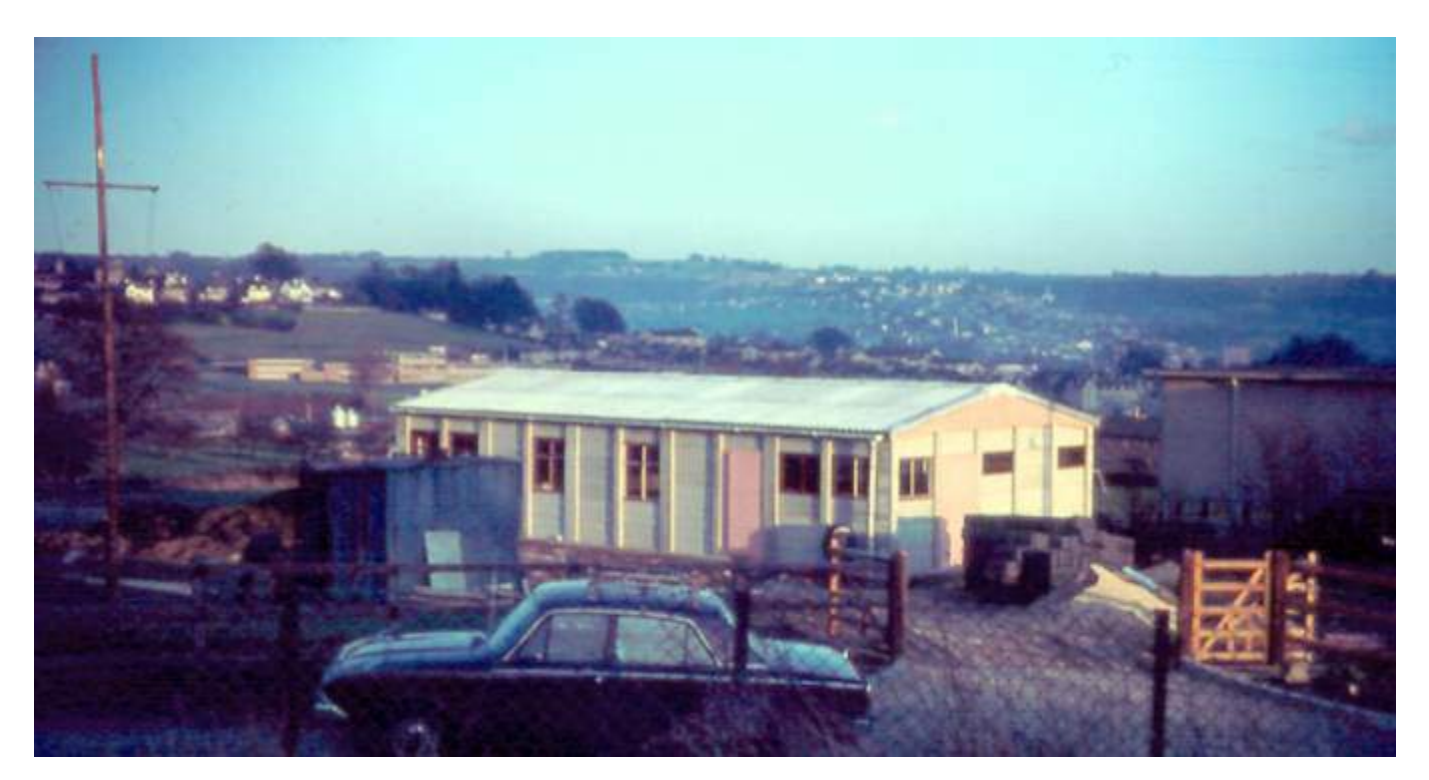
HQ under construction.