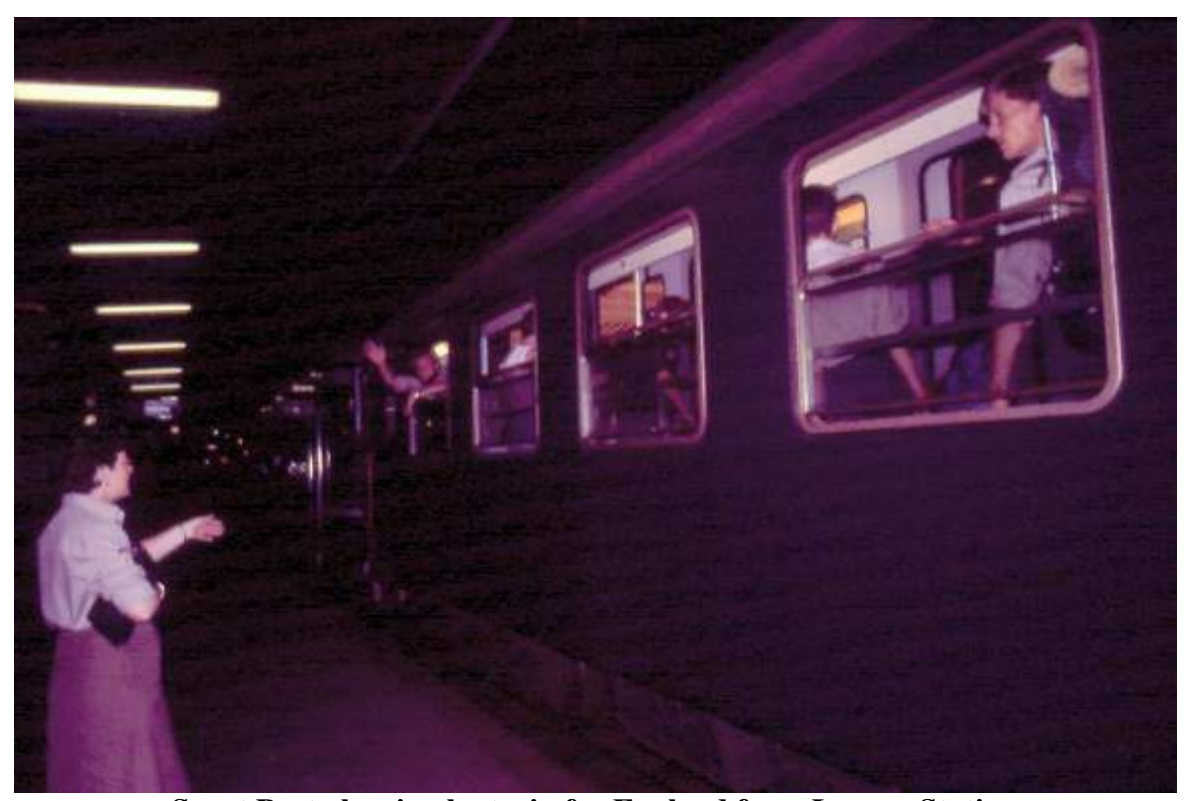
Scout Party leaving by train for England from Luzern Station