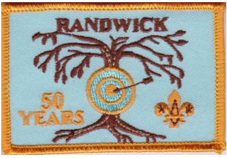
Page 30 of 72 G:\Shared drives\Exec\History\Haggis\History of Randwick Scout Group - 2021 Updated - Compressed.docx