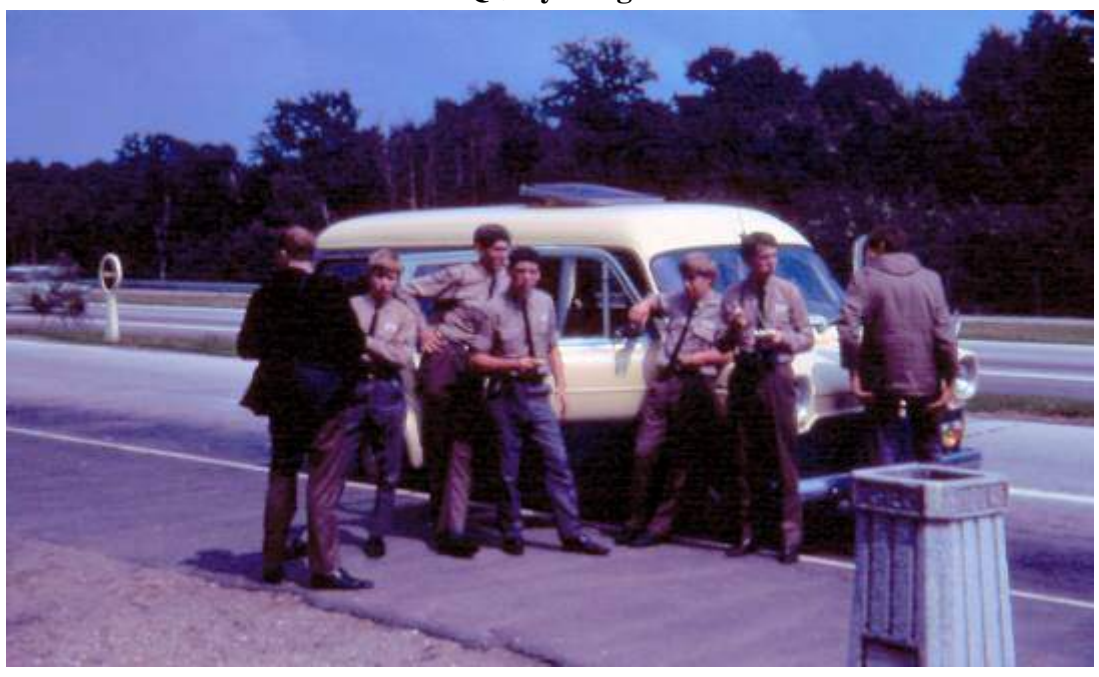
Venture Scouts on the way to Switzerland 1968