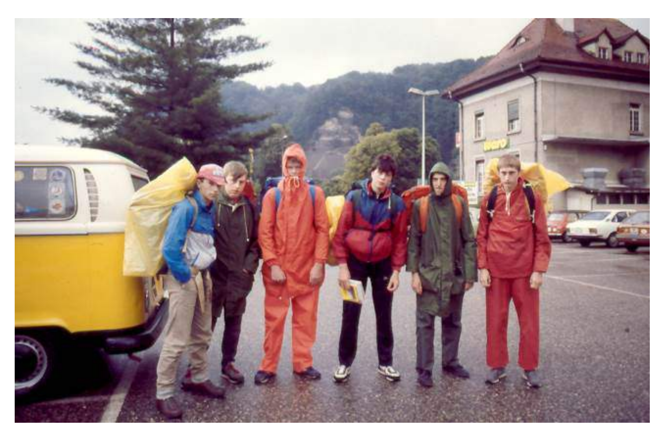
Venture Scouts preparing to start their 3-day expedition at Burgdorf some 60 miles from Luzern, where they were to meet the rest of the Group at the Phadiheim Musegg HQ in Moosmattstrass.