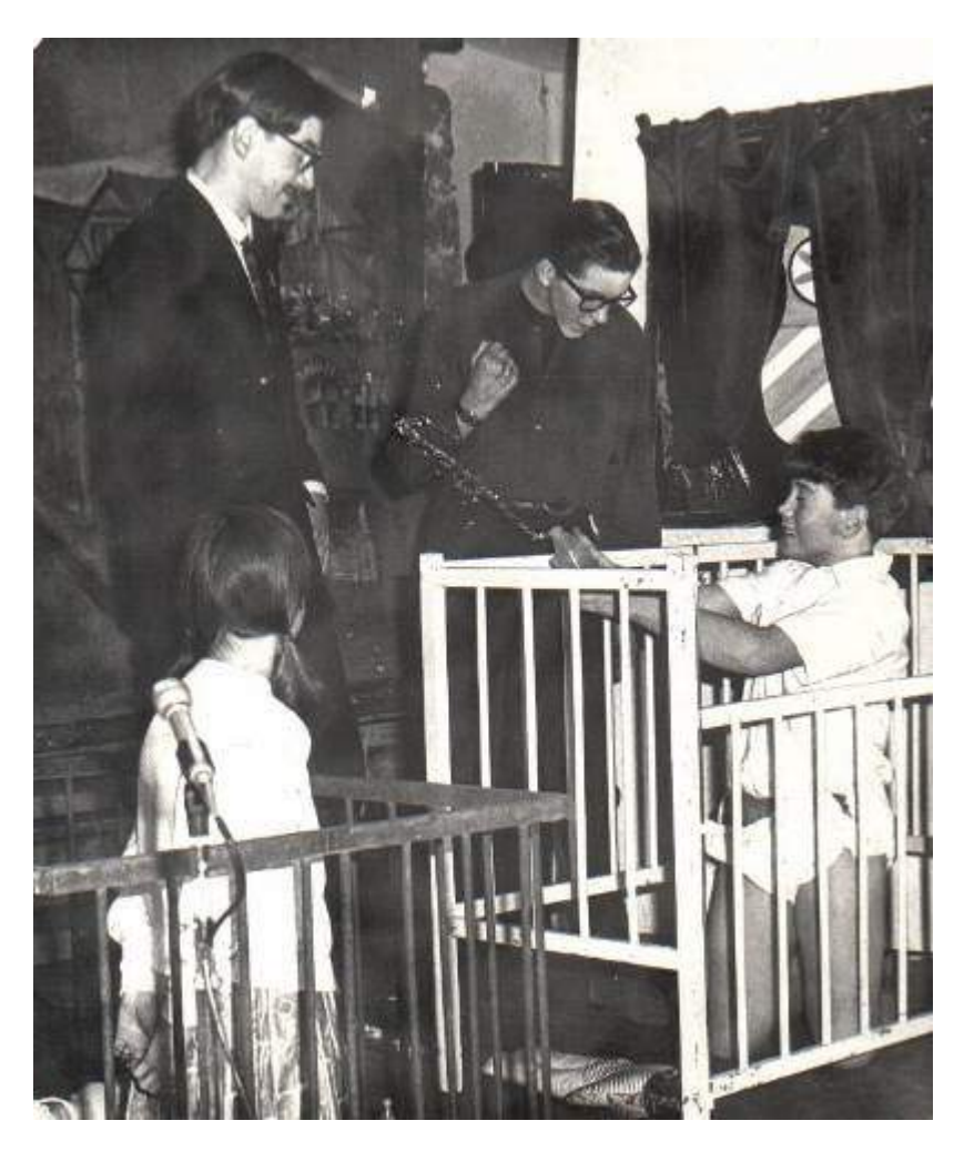
Page 8 of 72 G:\Shared drives\Exec\History\Haggis\History of Randwick Scout Group - 2021 Updated - Compressed.docx