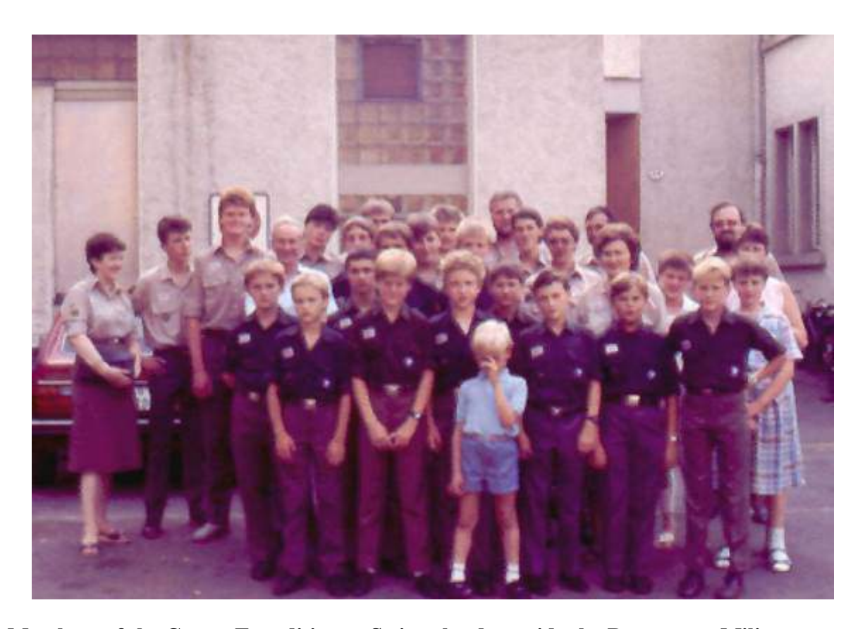
Members of the Group Expedition to Switzerland, outside the Restaurant Militargarten, Allmend, Luzern. The party being due leave by train after the meal, for Randwick from Luzern Bahnhof.