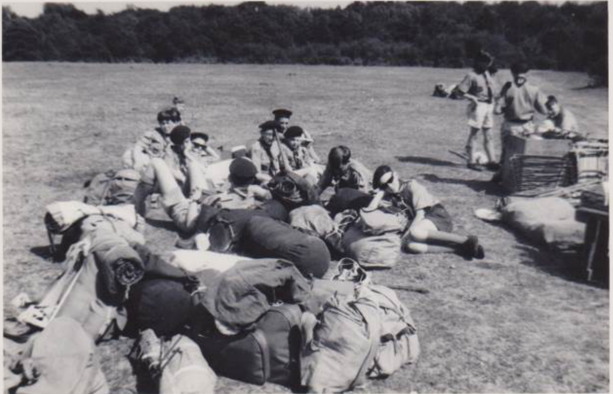
Waiting for the Lorry Home