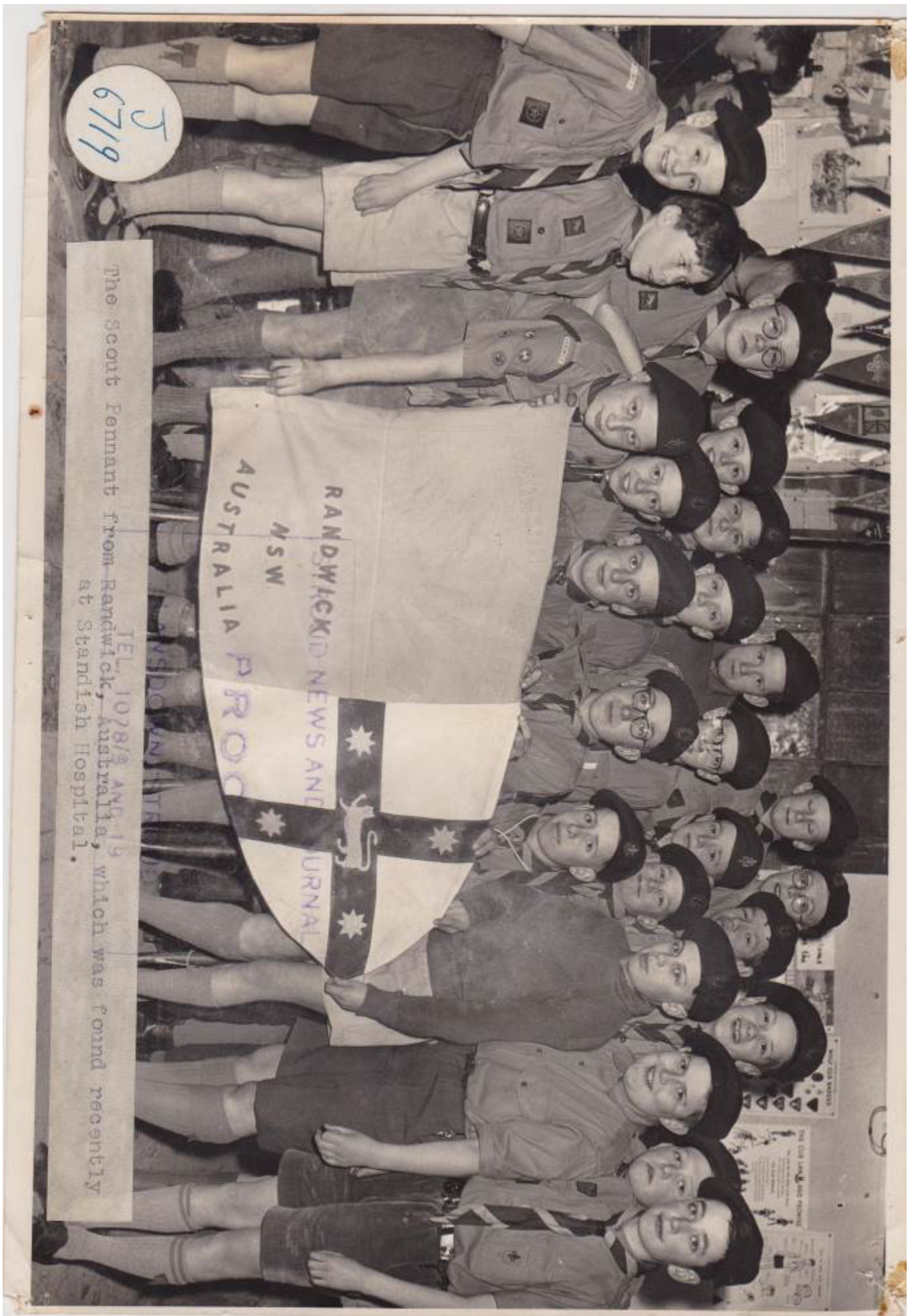
The Scout Pennant from Randwick, Australia, which was found recently at Standish Hospital.