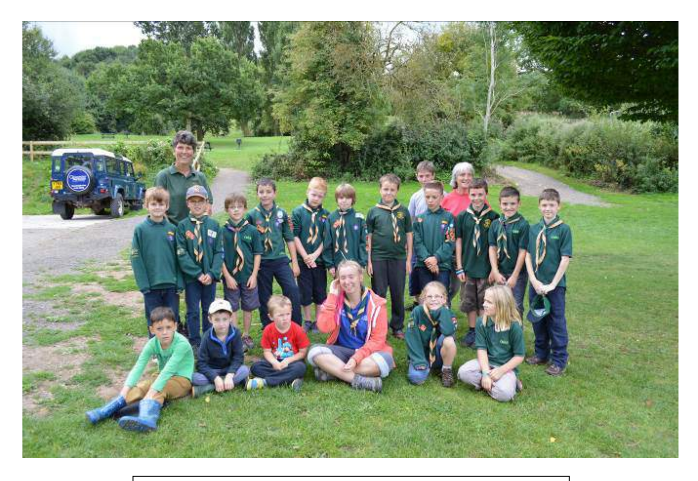
Randwick Cubs visit to Robinswood Hill Country Park 2014