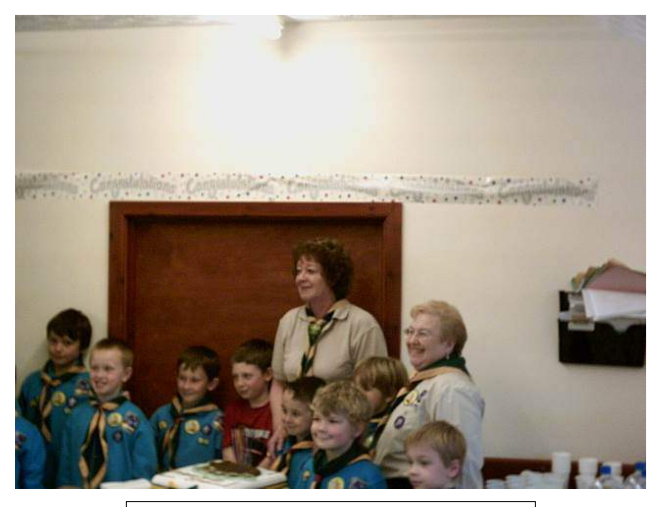
Beavers Celebrating 20 years of Randwick Beavers