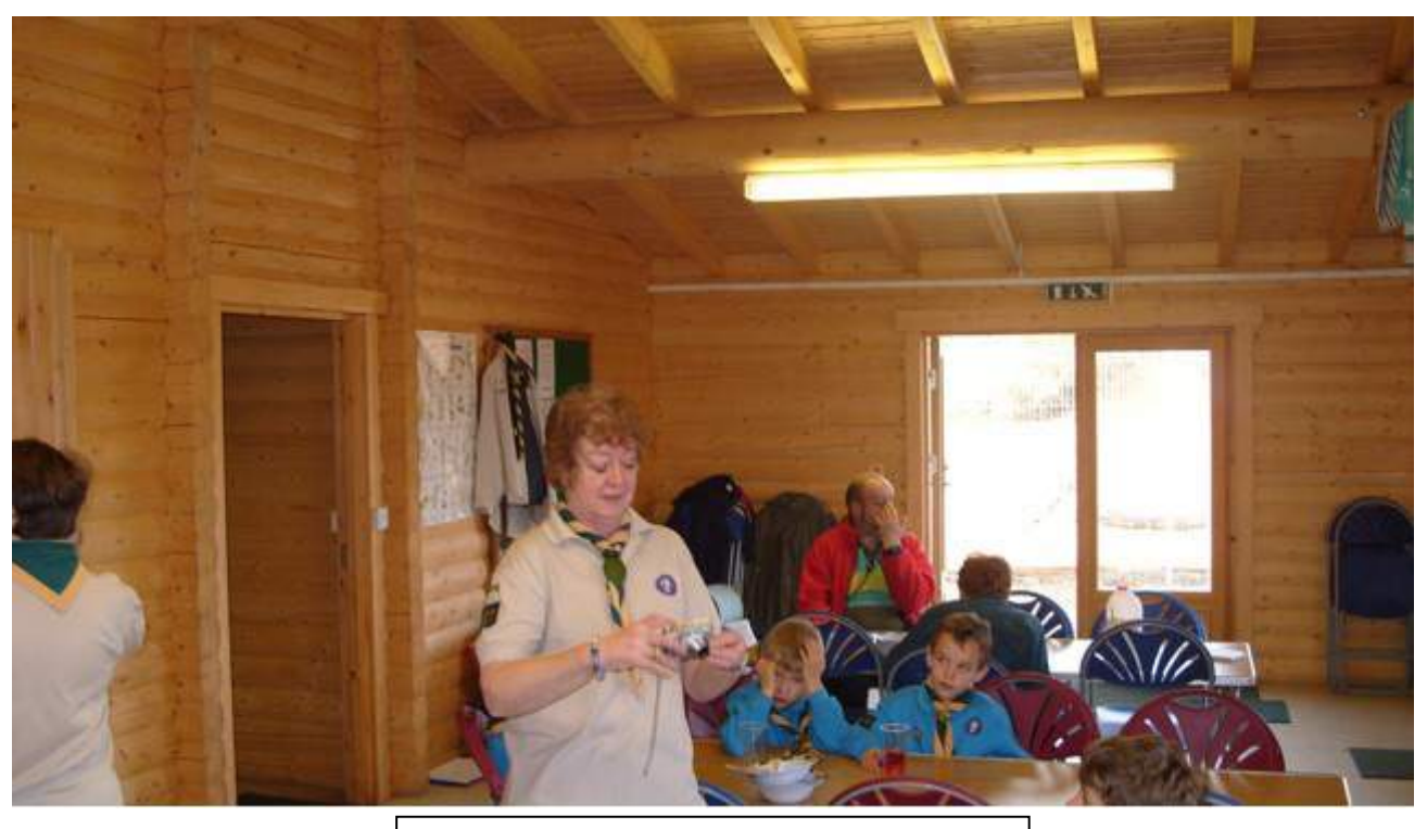
Beavers at Penn Wood Log Cabin

Page 68 of 72 G:\Shared drives\Exec\History\Haggis\History of Randwick Scout Group - 2021 Updated -Compressed.docx