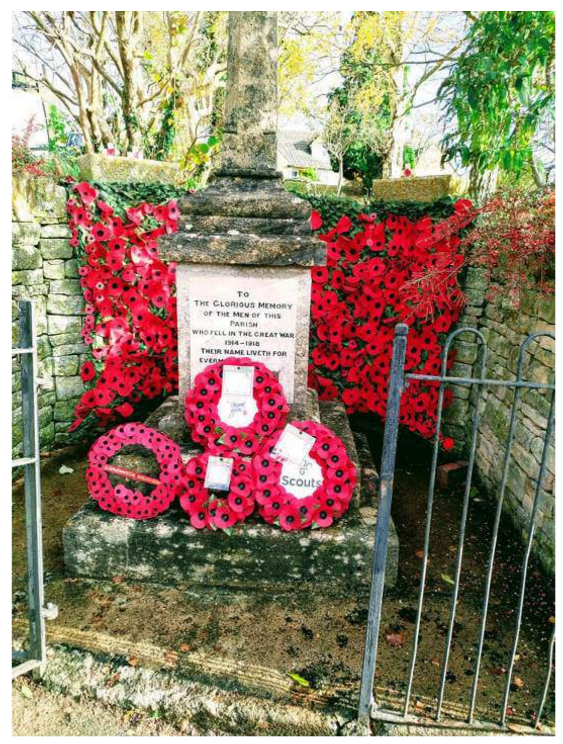
Randwick War Memorial 2018